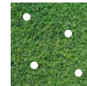
Premium size Fertilizer applied at 2 kg /100 m 2