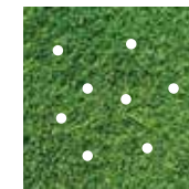
Mini size Fertilizer applied at 2 kg /100 m 2

At the same applied rate, fertilizers of a smaller size will contain many more particles than one of a larger size. Mini-sized particle provides excellent distribution at lower application rates. Using fertilizers of smaller sizes will increase the uniformity of nutrient distribution which results in more even colour, smoother turf playing surfaces and healthier turf. Designed for use on tees and closely mowed fairways. Try our mini-sized blends for optimum performance and healthy turf to see the difference!